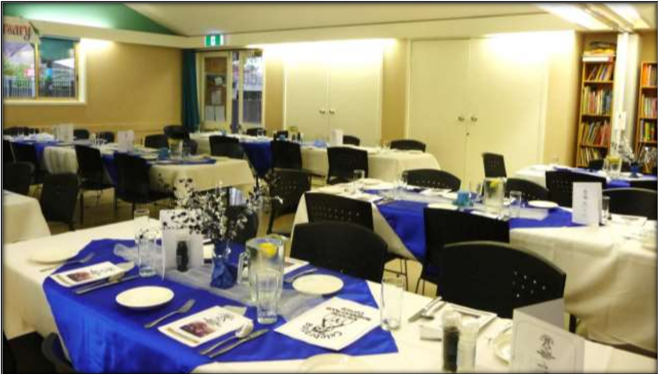
A wall mounted TV (DVD/USB facilities) and projector screen.

Four sky lights provide natural light. Seats 60 people comfortably. The room can be partitioned into 2 rooms if needed. Each end of the room has air conditioners, ceiling fans, TV with output and a large projector screen.