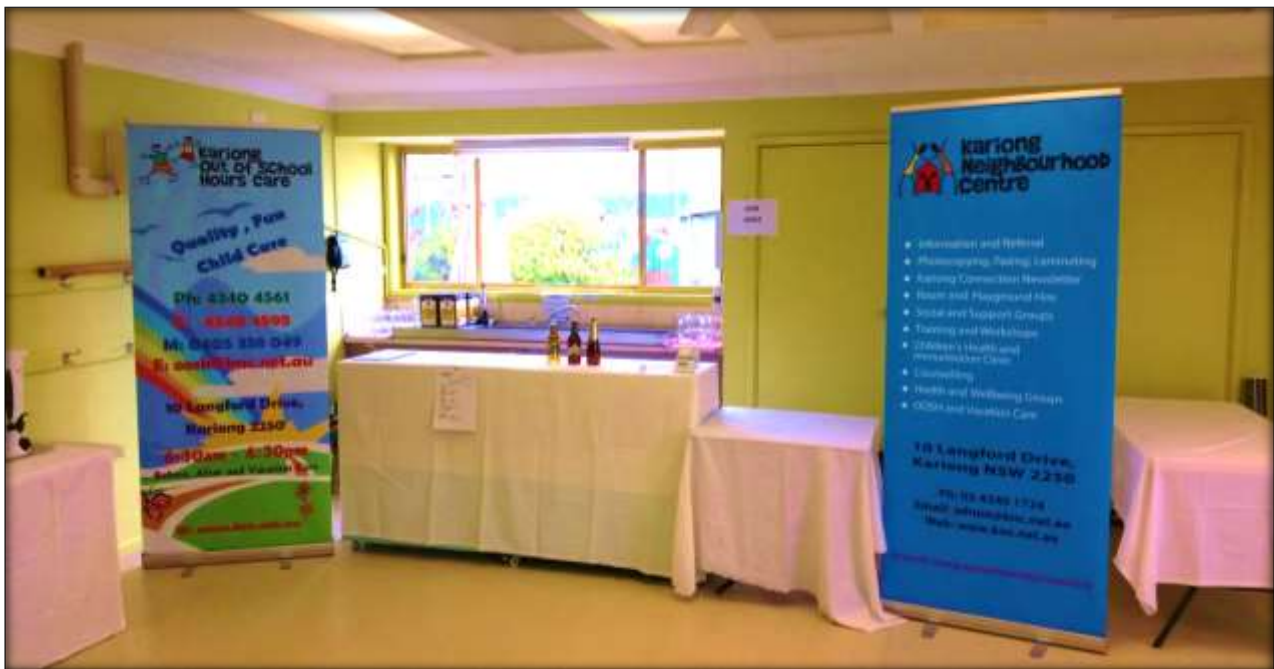
Bar set up for corporate functions -