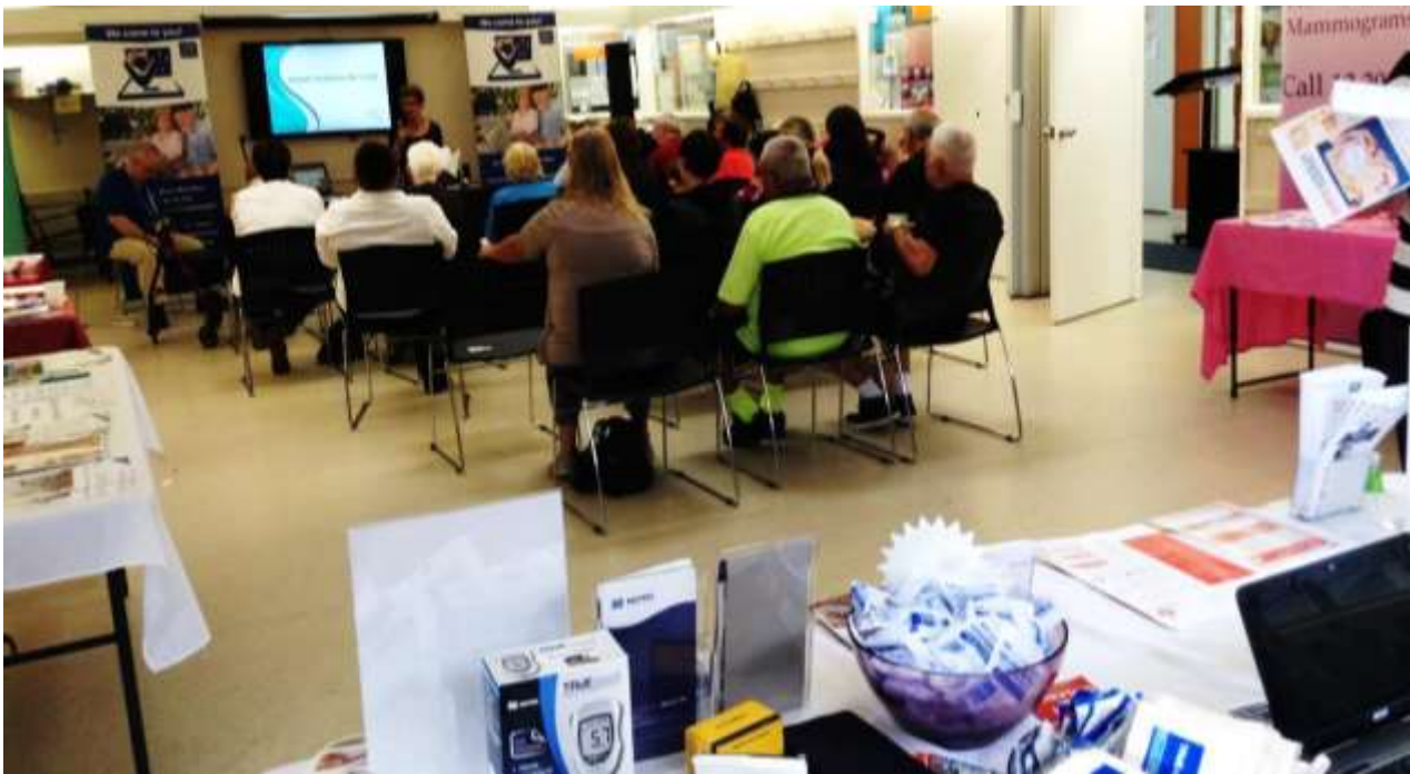
Training and events can seat up to 80 people