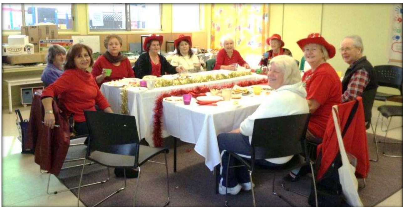
Group functions up to 20 seated comfortably