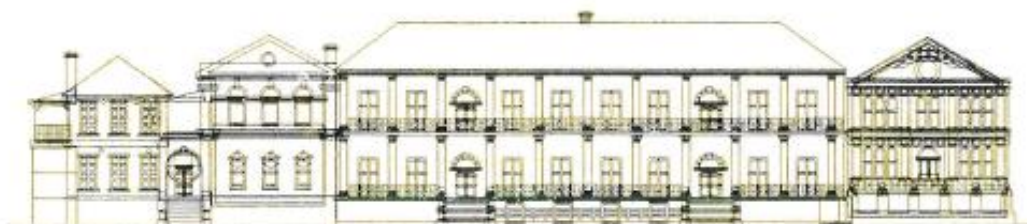
Liesl Tesch MP

Wowee! There are just not enough minutes in the day for all the great work that Fiona and her team of staff and volunteers at Kariong Neighbourhood Centre need to do. They are amazing contributors to the community, providing a full, wraparound service to many families who are stretched to the limit. From the moment people walk through the doors, they are welcomed into a safe and friendly environment that promotes a sense of connected belonging. I was thrilled to see the very detailed 3D map of the whole community in the foyer. The team at Kariong Neighbourhood Centre provides an active playgroup, craft and chat group, Pilates for seniors, an over-50s friendship group, tai chi, yoga—the list goes on—as well as massively successful out-of-school-hours care, supporting many Kariong families who spend long days commuting to jobs in Sydney. It would be even better if community organisations could provide still more services to support people in Kariong that the community centre identifies have needs beyond its abilities. I thank those at the Kariong Neighbourhood Centre for all the love and positive energy they deliver to the community.