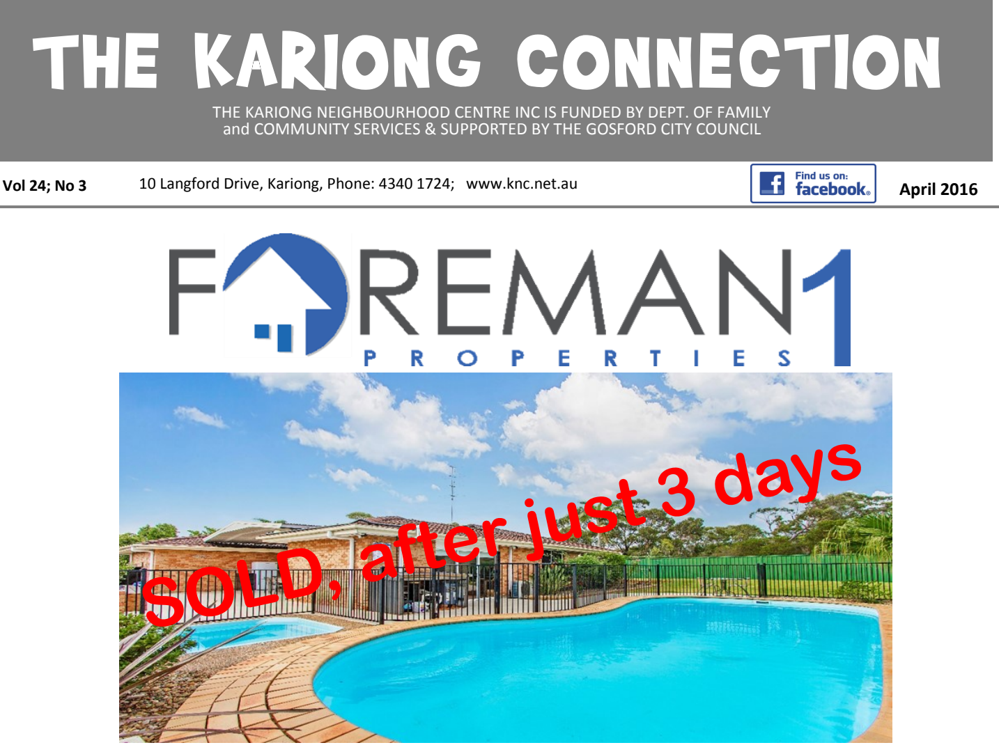
Feature Listing!!!!! 16 Hayter Close. Kariong

Tucked away at the end of a quiet cul de sac location and backing on to National park this thoughtfully designed home represents an outstanding lifestyle opportunity. Multiple living areas that capture an abundance of natural light all on a level 1059sqm parcel of land make this an ideal family retreat.